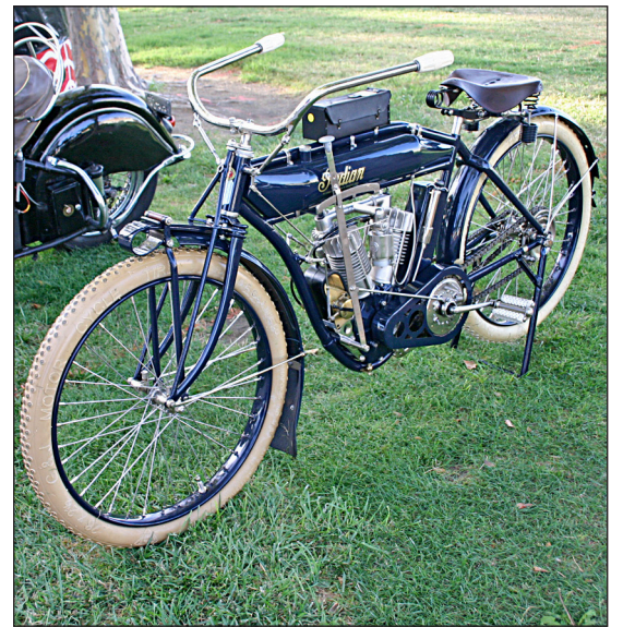
Bob Clift's 1911 Indian Little Twin took oldest bike honors.