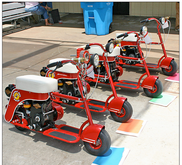
Dick Crawford entered four Doodlebugs in national judging. ". . .If you're going to deduct points on this one, then try the next one."